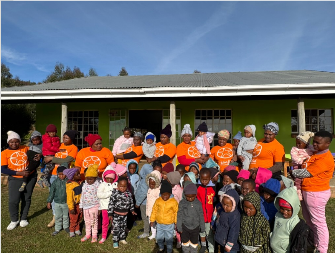
Early childhood development/creche