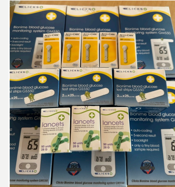
Glucose monitoring kits