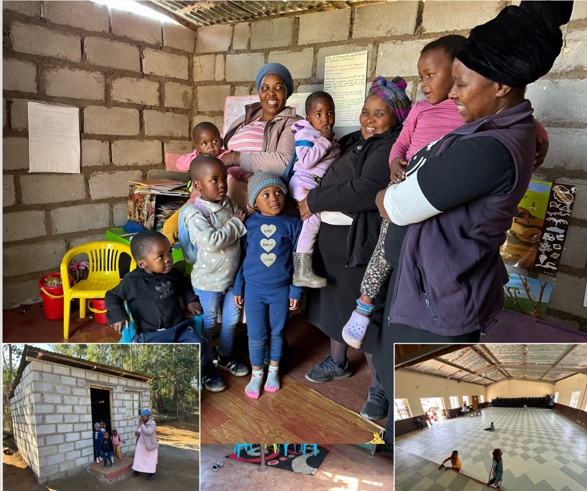
Outlying creches were very basic and with limited toys/books